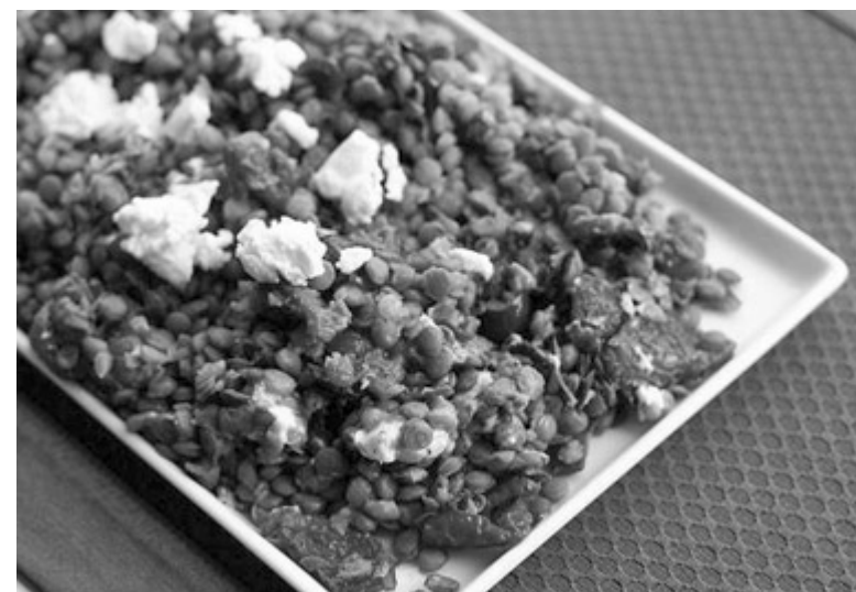
The delightful Mediterranean Lentil Salad from the Chicago-based blog Elly Says Opa.

"It's a very exciting time for Greek food. Non-Greeks are getting a better grasp on what real food is like. What they've experienced