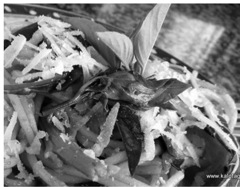
The colorful and delicious Makaronia Me Vliita kai Vasiliko from the blog Kalofagas.

"The blog is a great forum to engage with my readers. I like the freedom to write about things I discover in my travels. It shows the more dynamic side of Greek cooking,